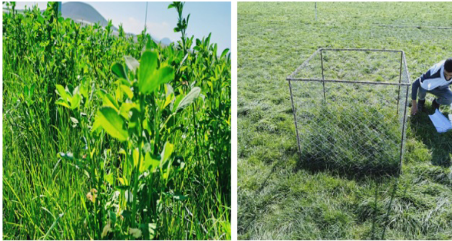
Figure 1. Sample collection from pasture.

bromegrass, alfalfa, white clover, and sainfoin, respectively. The seed bed was prepared by ploughing and then firming with a field cultivator and harrow. After the seeds were thoroughly mixed on a tarpaulin at the specified rates, sowing was conducted by a universal type of seeder by adjusting to 30 \text{ kg ha}^{-1} -mix seeds. During the sowing, 30 kg of diammonium phosphate (DAP) fertilizer was used per hectare with a seeder. The pasture was sown in the first week of October 2019.